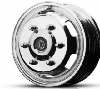
Alcoa Dura-Bright® Aluminum Wheels Optional – All 6 Wheels