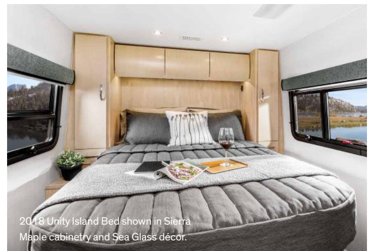
2018 Unity Island Bed shown in Sierra Maple cabinetry and Sea Glass décor.