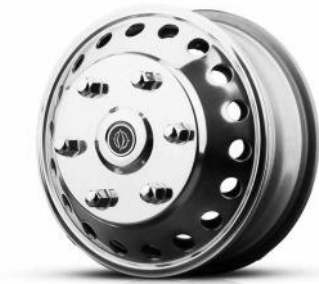
Steel Wheels Standard – With Wheel Simulators