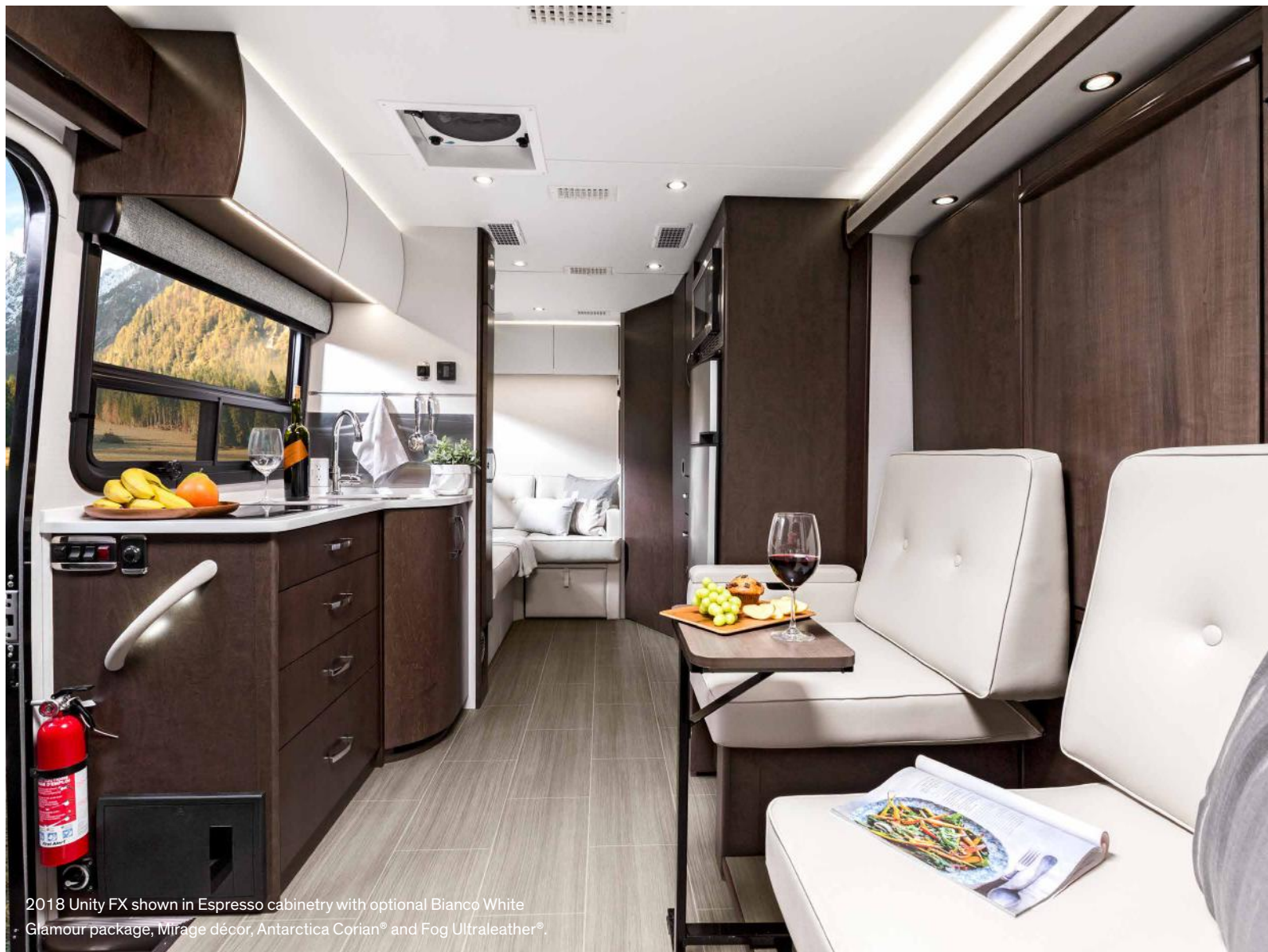
2018 Unity FX shown in Espresso cabinetry with optional Bianco White Glamour package, Mirage décor, Antarctica Corian® and Fog Ultraleather®.