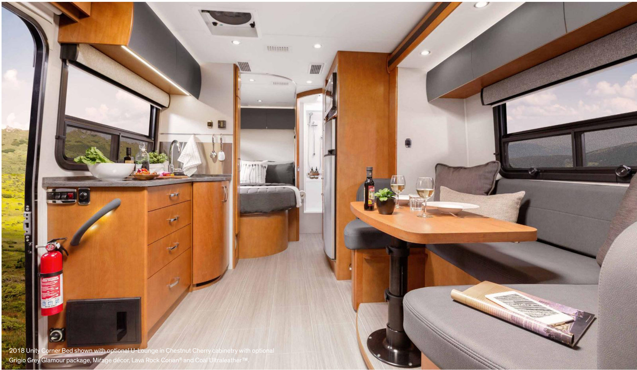
2018 Unity Corner Bed shown with optional U-Lounge in Chestnut Cherry cabinetry with optional Grigio Grey Glamour package, Mirage décor, Lava Rock Corian® and Coal Ultraleather™.