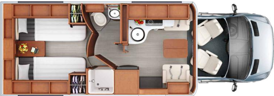
U24TB | Twin Bed