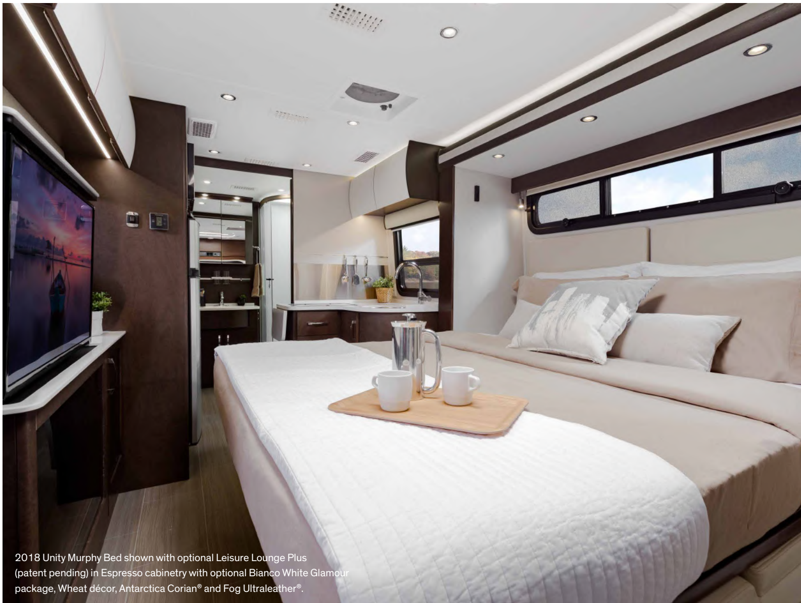
2018 Unity Murphy Bed shown with optional Leisure Lounge Plus (patent pending) in Espresso cabinetry with optional Bianco White Glamour package, Wheat décor, Antarctica Corian® and Fog Ultra leather®.