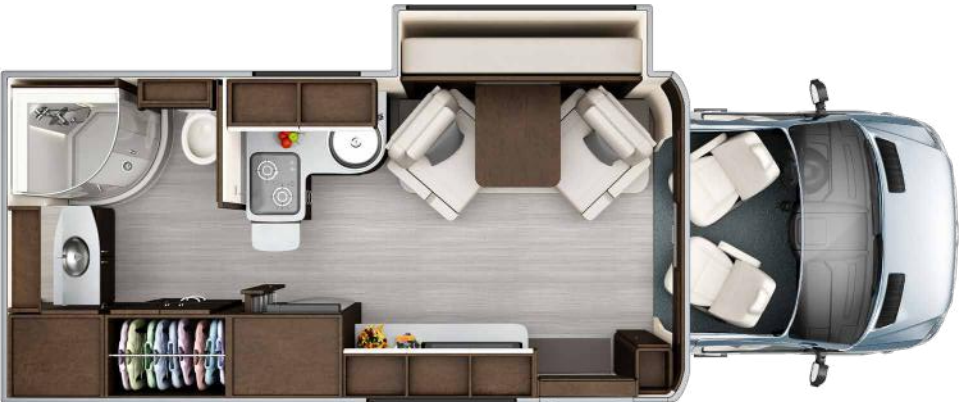
U24MB | Murphy Bed (Shown with optional Leisure Lounge Plus)