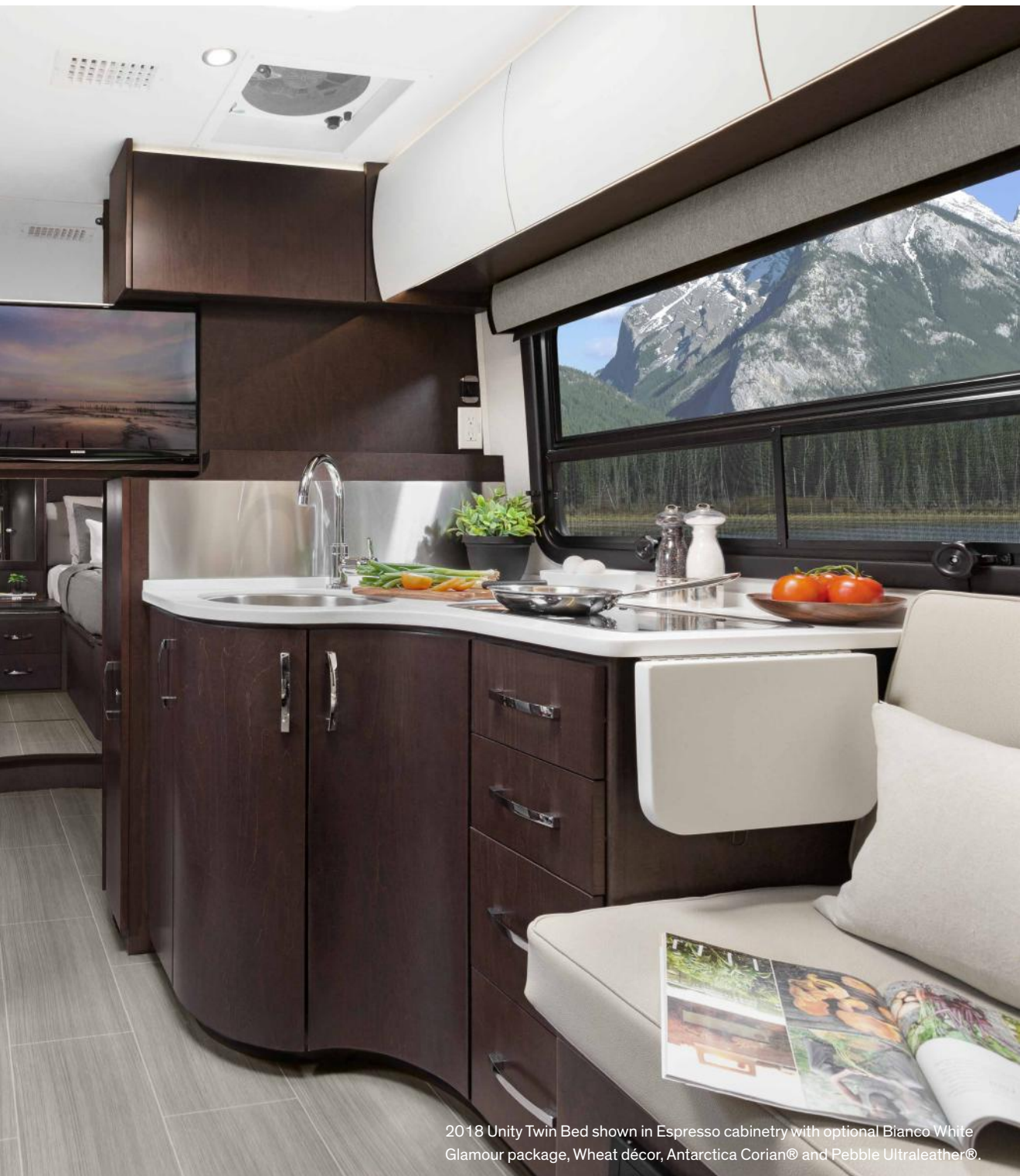
2018 Unity Twin Bed shown in Espresso cabinetry with optional Bianco White Glamour package, Wheat décor, Antarctica Corian® and Pebble Ultraleather®.