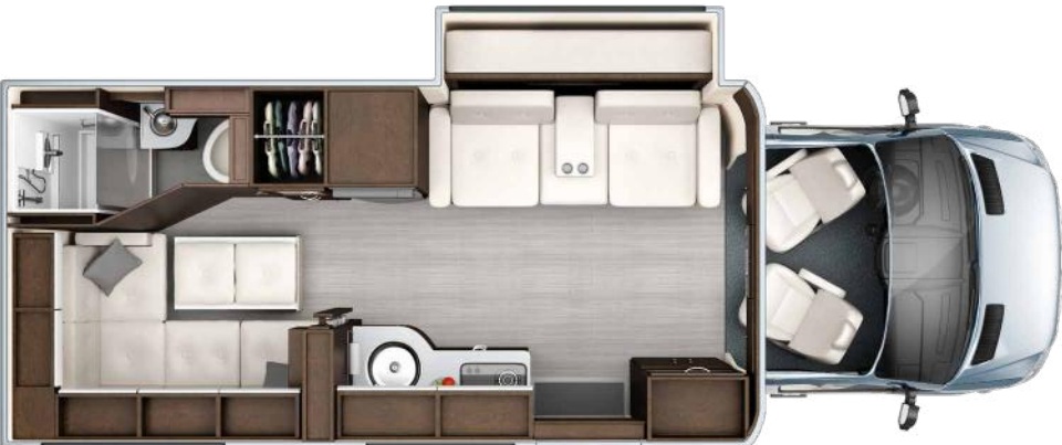
U24FX | Flex