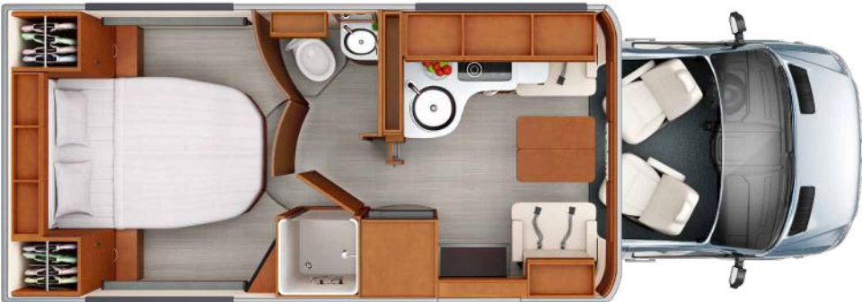
U241B | Island Bed