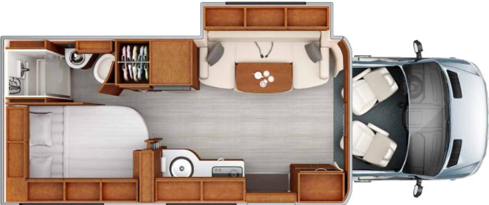
U24CB | Corner Bed (Shown with optional U-Lounge Dinette)